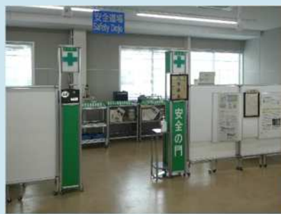
Dojo to learn about safety