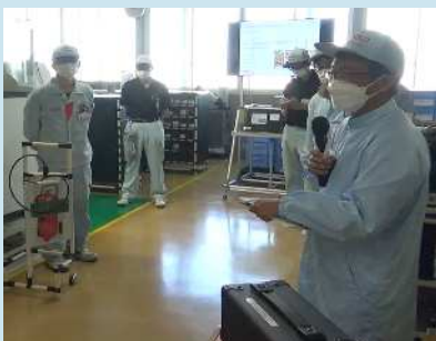
Safety diagnosis by top management (Disclosure Arrangements)